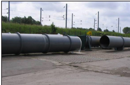
Sections of pipe prior to protection with ARC S4+

Corrosive constituents of converter gas condensed onto the bottom of the pipes and aggressively destroyed previous lining and steel substrate.