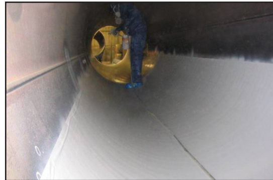
Application of the ARC S4+ was completed using airless spray equipment